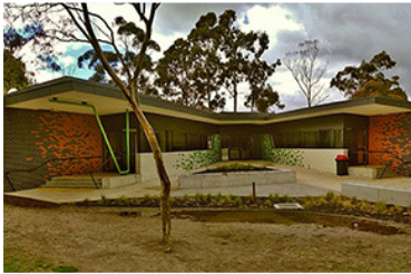
Whittlesea Secondary College