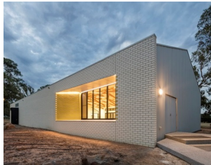
Regional Prize | Pomonal Community Hall | Workshop Architecture

The Australian Institute of Architects Awards program offers an opportunity for public awareness and peer recognition of the innovative work of our Victorian Architects. The 2017 Victorian Awards were announced on Friday 30 June at the Melbourne Exhibition and Convention Centre, and there were some outstanding projects on display.